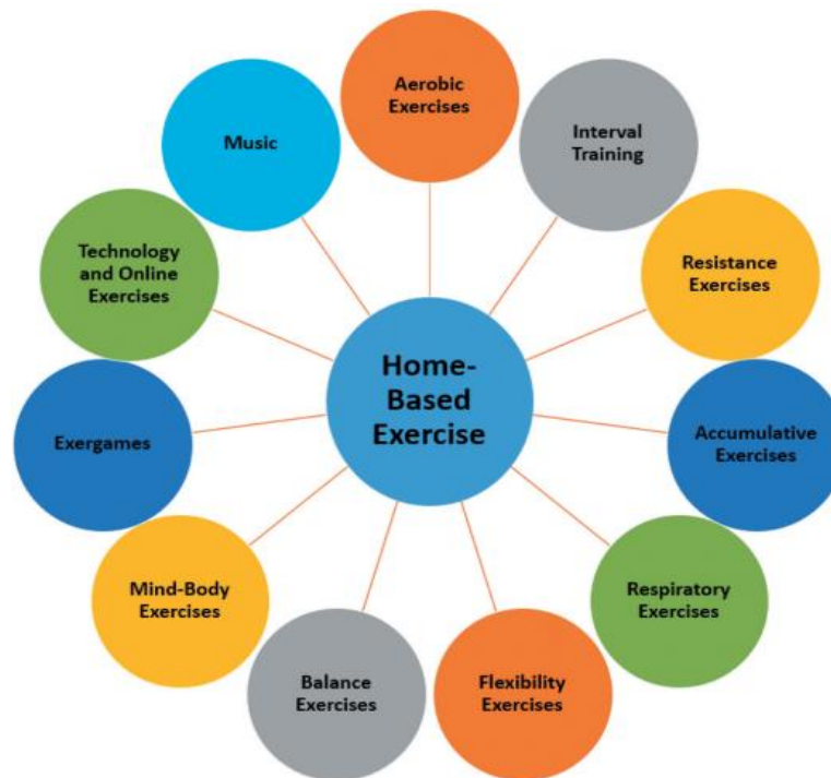
Figure 1. Home-Based Exercise (Ghram et al., 2021)

minutes/session and 2 session/day. So, hypertensive older people are strongly advised to do physical exercise independently during this pandemic based on some of the options that have been mentioned above.